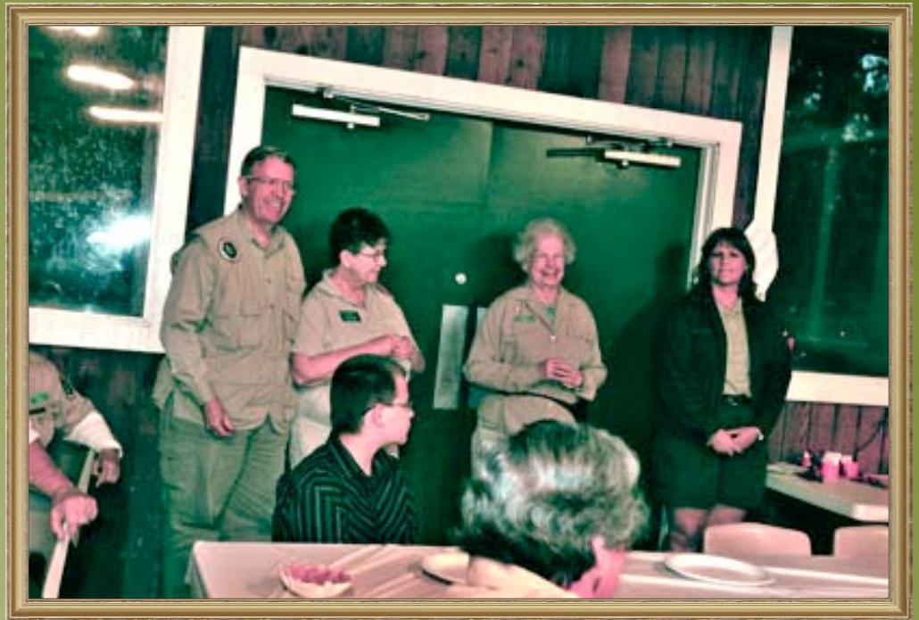
Volunteer Picnic, 2009